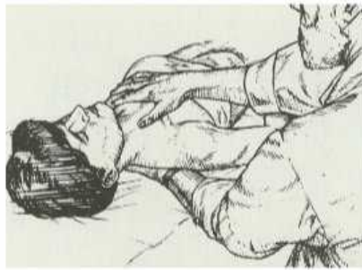
Thoracic inlet release