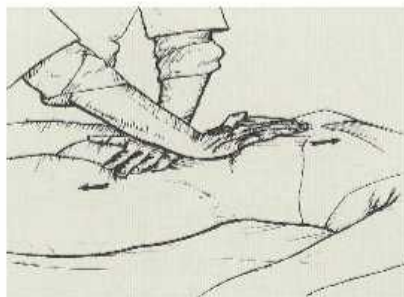
Psoas area release