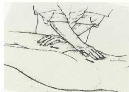
Anterior hip release